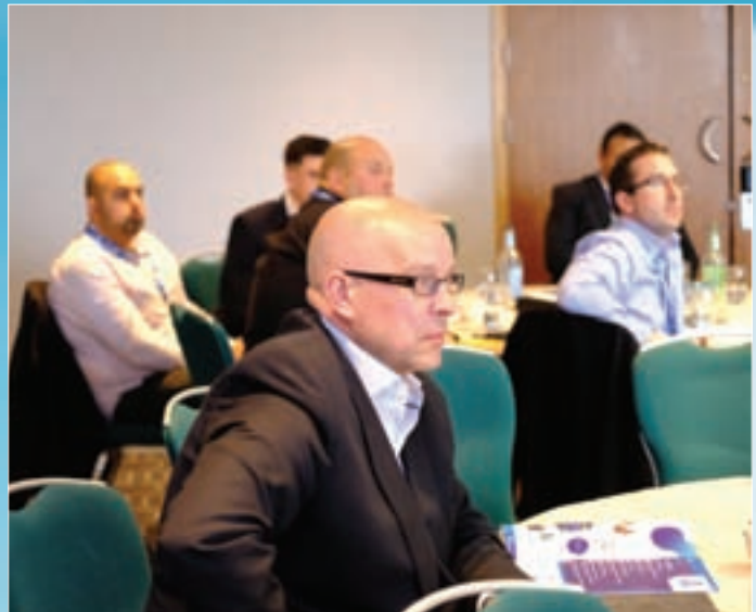
Local authority fleet and transport managers from all over Wales attended the conference, which was supported by CIWM Wales.

The Optimised Waste and Logistics (OWL) show, held at the St Davids Hotel in Cardiff on April 12 2018, brought together high-profile speakers and industry leaders from both the public and private sectors. Among the topics up for discussion were driver and road safety, the future of FORS, the commercialisation of services, e-learning, and electric RCVs.